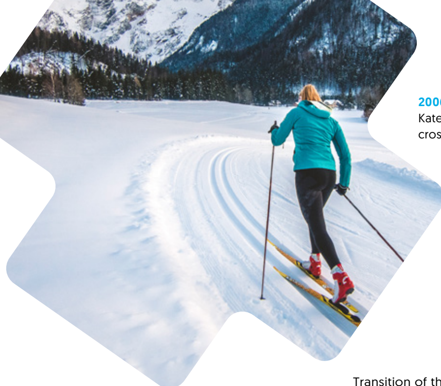
2006 Turin Kateřina Neumannová, cross-country skiing

LCS acquires a strategic partner, the ASSECO Group, which buys a 55% share in the Company.