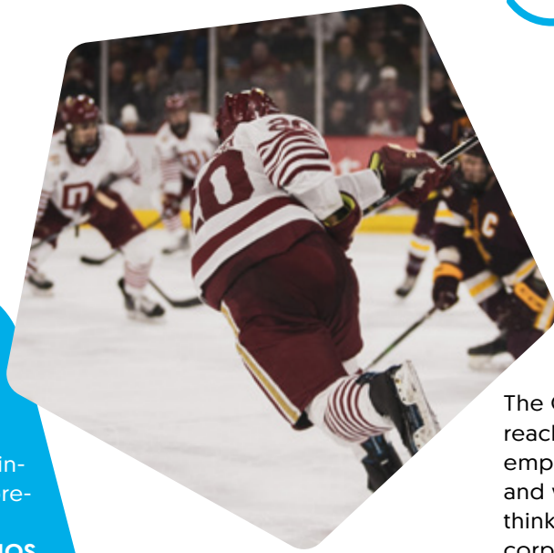
1998 Nagano Ice hockey

The origin of LCS as a small “garage start-up”. Four owners and the first employee.