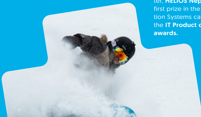
2022 Peking Ester Ledecká, snowboarding

Spiska wins Notable Product of 2022 and Asseco Solutions receives Gold partner status of the company Geetoo .