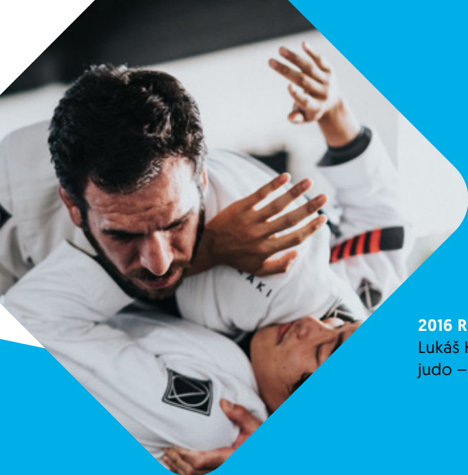
2016 Rio de Janero Lukáš Krpálek, judo – 100 kg

The first product is launched from the joint laboratory of the multinational company Asseco Solutions . All core products are newly offered on a cloud platform called ERPORT .